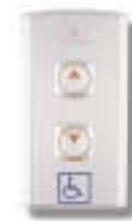
HPB-640 (Boxless Type)