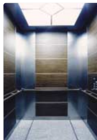
▲ Asan Medical Center, Seoul, Korea