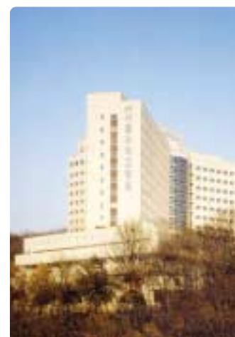
▲ Seoul National University Bundang Hospital, Gyeonggi-do, Korea

Integrated into the system is such an advanced technology as VVVF (Variable Voltage Variable Frequency) inverter drive which serves the purpose of great cost reduction by innovative energy saving, as well as excellent riding comfort of elevators. Basically, Hyundai Hospital Bed Elevators are planned, designed and manufactured, bearing passengers' security and convenience first in mind. The elegant designs and various features that these elevators show off are the key to enhancing the dignity of hospital facilities in addition to providing the amenities that hospital pursues.