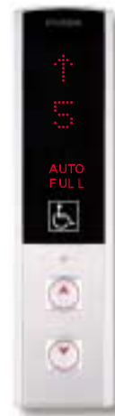
HIP-D640 (Boxless Type)