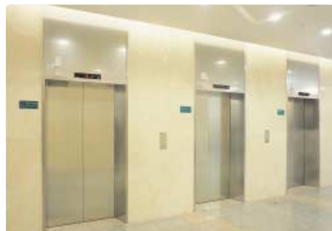
▲ Asan Medical Center, Seoul, Korea

Hyundai Hospital Bed Elevators, a right choice for your hospital needs are designed to greatly contribute to provide the most secure and reliable ambience that your hospital requires.